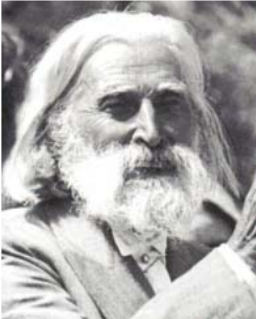
Beinsa Douno (Peter Deunov)